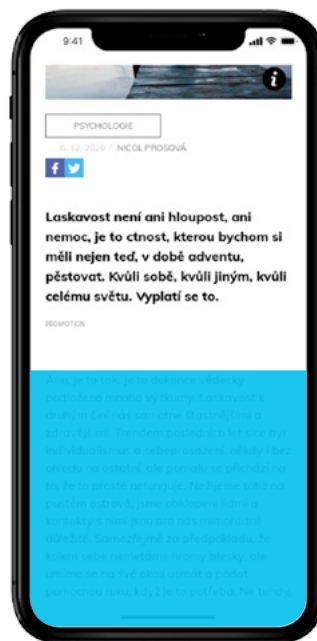
INTERSCROLLER MOBILE RECTANGLE