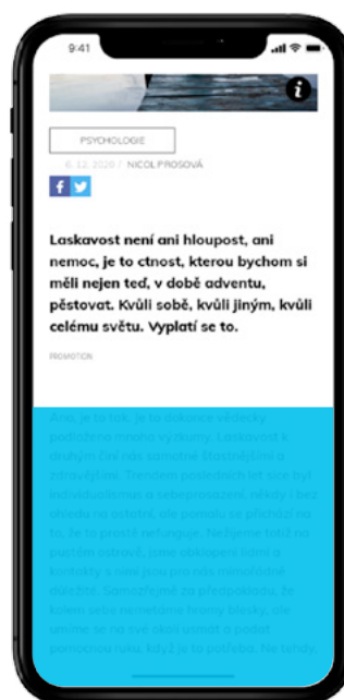
INTERSCROLLER MOBILE RECTANGLE